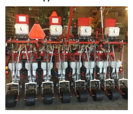
Type A: Band applicators

Granule spreaders can be fitted in the front or rear section of a vehicle (tractor, ATV, jeep, ...) or one or more devices can be mounted on an implement.