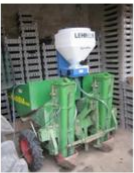
Type B: Full-width applicators