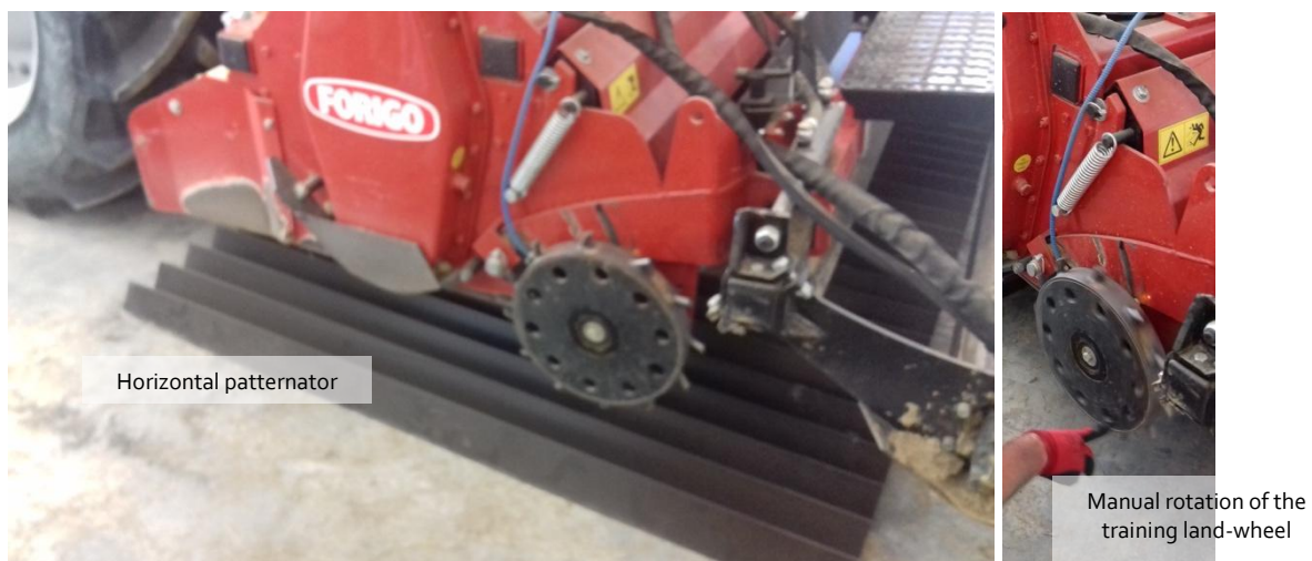
Figure 7. Rubber granules collection using horizontal patternator.

Different way was followed to measure distribution uniformity of FORIGO machine; the presence of air flow inside the hopper draining pipes did not allow to fix the plastic bag at they output. So, a horizontal patternator fitted by grooves, similar to that used to check the distribution uniformity of boom sprayers, was employed. The patternator was placed on the soil surface, directly under the machines that was lifted up 5 cm on the edge wall grooves level (Figure 7). The supplied dose was provided through the manually revolution of trailing land-wheel (Figure 6); also in this case the trail duration corresponds to 10 completed revolutions.