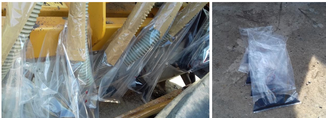
Figure 5. Rubber granules collection using plastic bags.

The distribution uniformity trials performed using OLIVER machine do not show any specific problem. A plastic bag was fixed at each hopper draining pipes output (12 in total) with the purpose to collect the rubber granules supplied (Figure 5). The machine supply system was manually activated through the revolution of cage roller (Figure 6). The distribution uniformity deriving from two different dosages were assessed: tested doses were determined by the activation of two pinion sizes (15 and 18 teeth pinion) and each trial duration was based on 10 completed revolutions of cage roller. Once finished the trials, the granules collected in each plastic bag were weighted to determine the precise amount supplied by each hopper draining pipes (Figure 5).