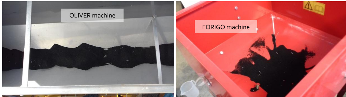
Figure 4. Rubber granules in the hoppers.

So the trials of distribution uniformity were performed using rubber granules to simulate the solid fumigant product; this specific materials was chosen based on previously results obtained at Crop Protection Technology (DiSAFA, University of Torino) facilities testing the functional inspection of micro-granulator (Manzone et al. , in press). During all the trials the amount of rubber granules was enough to ensure the full coverage of granules supplier mechanical elements (Figure 4).