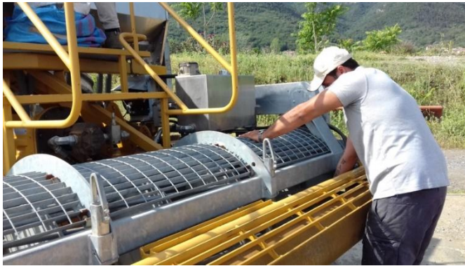
Figure 6. Manual rotation of the cage roller.

Different way was followed to measure distribution uniformity of FORIGO machine; the presence of air flow inside the hopper draining pipes did not allow to fix the plastic bag at they output. So, a horizontal patternator fitted by grooves, similar to that used to check the distribution uniformity of boom sprayers, was employed. The patternator was placed on the soil surface, directly under the machines that was lifted up 5 cm on the edge wall grooves level (Figure 7). The supplied dose was provided through the manually revolution of trailing land-wheel (Figure 6); also in this case the trail duration corresponds to 10 completed revolutions.