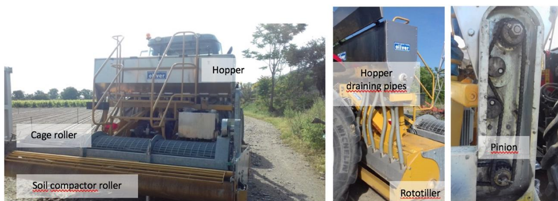
Figure 1. – Solid fumigant applicator model OLIVER FPA 300.

The solid fumigant applicator OLIVER FPA 300 (Figure 1) is equipped with a 350 Kg single hopper. Eight metering units are placed on the hopper bottom; from each metering unit two pipes distributor deliver the fumigant product to the soil. The machine is equipped with front rototiller and rear soil compactor roller that are activated by PTO unit. The cage roller, due to the contact with soil, transmit the movement to the pinion that control the rotary movement of metering units; the fumigant application is allowed by machine forward progression. The metering units provide a fix volumetric dosage and the applied dose is determined varying the pinion dimension. Once distributed on the soil surface, the fumigant product is buried and mixed with soil by the rototiller action.