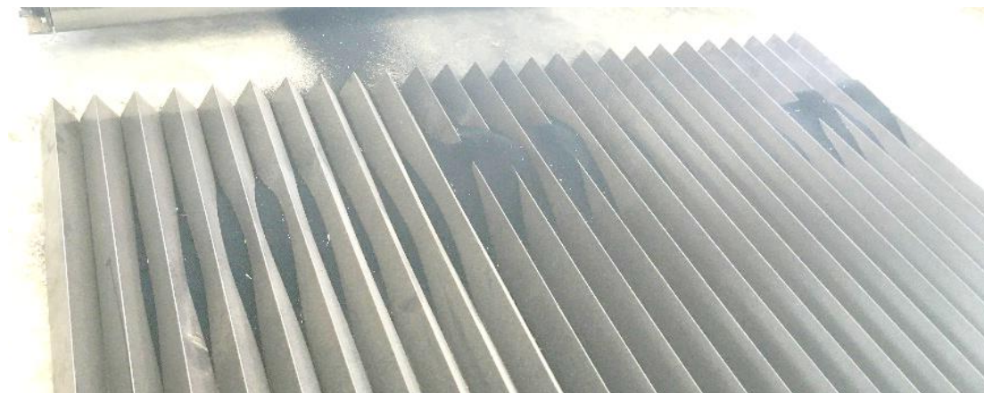
Figure 8. Example of bad distribution obtained

The uniformity distribution problems encountered during trials were reported to the FORIGO manufacturer. The manufacturer was already aware about the uniformity distribution problems of the machine model inspected. Furthermore, the manufacturer confirmed that the problem is linked to the uniformity of distribution of fan airflow rate among the six hopper draining pipes. The fumigant product, once arrived in a unique collector, is divided between the six draining pipes, but only by the fan air flow. This means that a minimal physical variation (e.g. humidity, etc.) of fumigant product at the time of distribution is translated in deep differences between product amount supplied by each draining pipe resulting in uneven distribution uniformity. As reported by the manufacturer, high improvements were recently included in the last model of this solid fumigant applicator, modifying the collector with six elements that separate equally the fumigant products between the draining pipes; the fan is only intended to aid the transportation of product inside the draining pipes. It will be useful perform further trials using this last version of FORIGO fumigant applicator to check the improved distribution system.