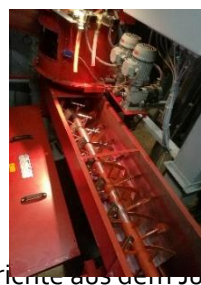
Pic. 3: Mixing chamber