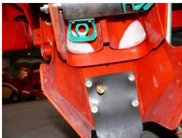
Pic. 9: Mobile spraying on seeds: Potatoe planter with nozzle between hopper and soil