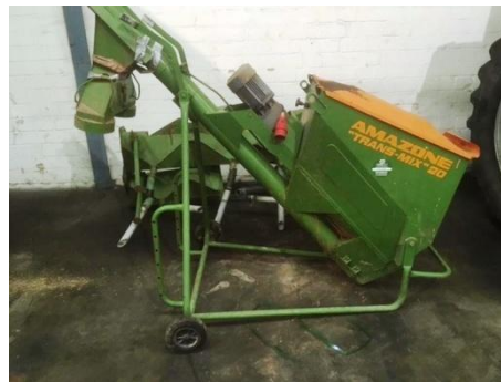
Pic. 6: Continuous treatment in auger like "Trans-Mix"