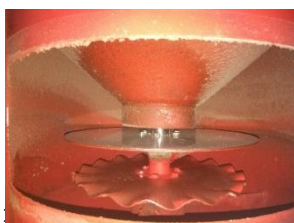
Pic. 2: Rotary atomizer in a continuous seed treatment system.

1. Continuous treatment: stationary equipment for cereals: Rotary atomizer followed by mixing auger in mixing chamber