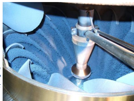
Pic. 8 right): Mixing chamber with rape seed with introduction of PPP via pump to a rotating disc atomizer