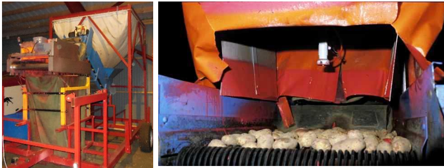
Pic. 4 and 5: Rotary atomizer under a hood