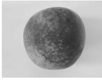
Fig. 1 Fruit of 'Diamond Princess' showing typical Fig. 2 dapple fruit symptom

21st International Conference on Virus and other Graft Transmissible Diseases of Fruit Crops