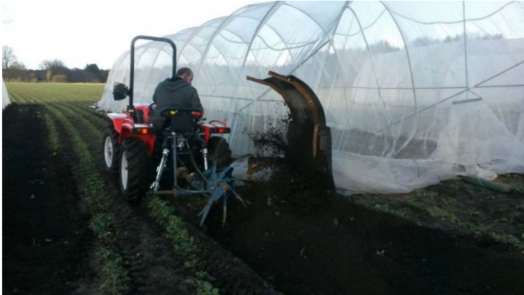
Photo 2 Hilling up soil by tractor with a modified ridge hilling machine