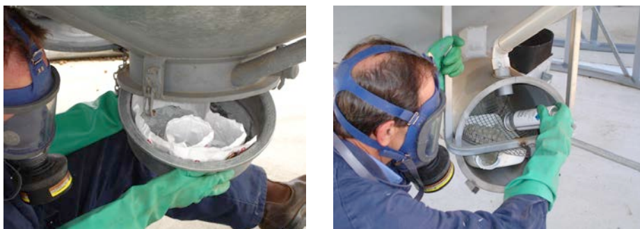
Fig. 6a & 6b

An important modification to the new silos was a deep bowl phosphine reaction chamber to hold a 'Bag Chain' formulation of AIP or a removable perforated steel plate in the base to hold the tablet formulation of AIP and allow the powder to drop through as phosphine gas is generated (Figs. 6a & 6b). In addition, the top lid on the silo was fitted with a cable and winch device, which is operated at ground level to open, close and seal the top lid also without having to climb the silo.