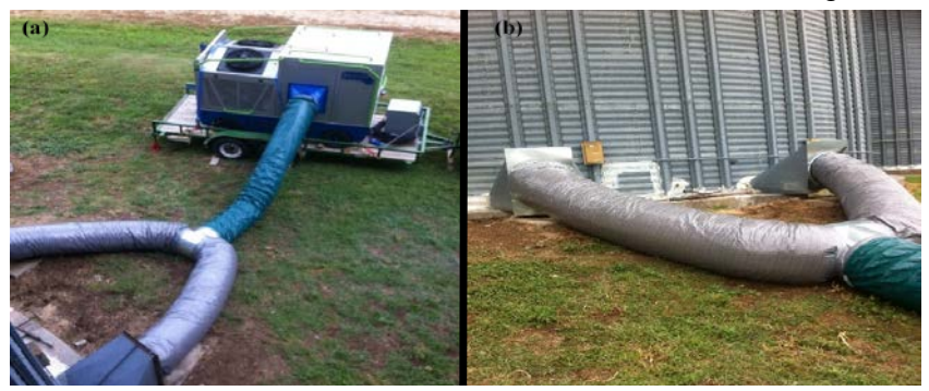
Figure 7. Grain chiller GCH-20 setup: (a) Insulated duct connected to the chiller's outlet at one end and to a "T" connector at the other, (b) Two ducts attached to the fan transition parts of the aeration fans that were removed.

The grain chiller GCH-20 used in this project was facilitated by the Brazilian company Coolseed (Santa Tereza do Oeste, Brazil). This equipment has the rated capacity to chill 100 to 170 t per 24-hour continuous operation in silos of up to 1,800 t, according to specifications of the manufacturer. The grain chiller was connected to the grain silo through thermally insulated ducts that were connected into the two inlets of the aeration fans that where removed from the (Figure 1).