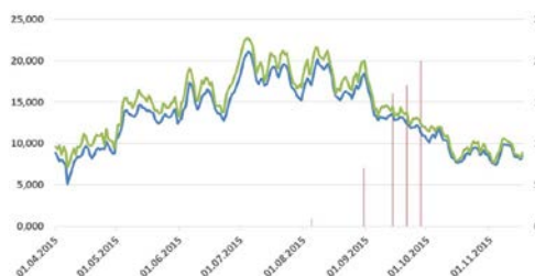
Fig. 3 Records of adult Plodia interpunctella (red bars) in a well-isolated grain store in Southern Germany in 2015. Left axis: surface temperature [°C], right axis: no. of moths. Blue line: mean temperature, green line: maximum temperature.

Baited traps placed in 5 cm depth in wheat caught more wasps compared to unbaited traps (t-Test, t = -3.530 , DG=4 , P = 0.024 ). In oats, no difference in wasps caught in traps placed in 5 cm depth was detected whether the traps were baited with webbings or not (t-Test, t = -1.444 , DG=4 , P = 0.222 ). More female wasps were caught in total with baits (t-Test, t = -2.119 , DG=22 , P = 0.046 ), but the presence of webbings as bait did not increased the number of males trapped (Mann-Whitney Rank Sum Test, T = 125.5 , n=12 , P = 0.163 ).