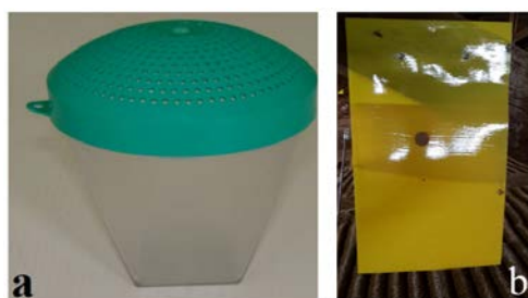
Fig. 1 Cone trap used for monitoring of Habrobracon hebetor (a) and adhesive trap baited with sex pheromone (ZE-TDA) (b) for monitoring of Plodia interpunctella in flat grain storage.

The number of trapped insects were compared with the help of a t-test, in case data were not normally distributed, the Mann-Whitney Rank Sum Test was applied. Statistical analyses were performed using the software package SigmaStat 3.1.