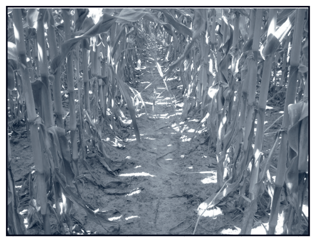
Fig. 6Weed-free maize field (July 19, 2008).Abb. 6Unkrautfreies Maisfeld (19. July 2008).

In Hungary, pre-emergent herbicides are still used widely, although it is known that these herbicides cannot control perennial weeds (e.g. Canada thistle [ Cirsium arvense ]), and are inefficient in the absence of soil humidity. To improve weed control in such cases, we developed a method in which glyphosate is sprayed by WeedSeeker sensors directed under the canopy of the crop plant.