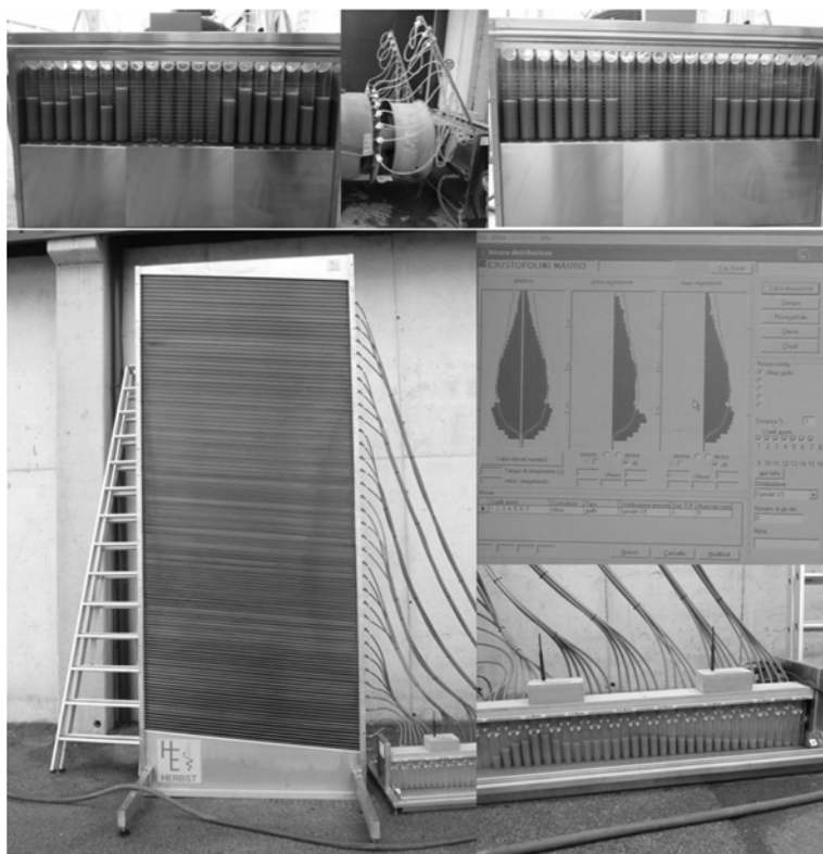
Fig. 3. Instrumental measurement of the nozzle flow rate and vertical distribution homogeneity during inspection and calibration activity.