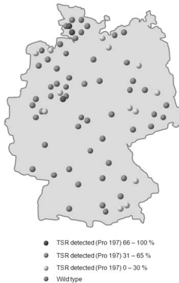
Fig. 3 Results of sampling program 2013.

ALS resistant Matricaria biotypes were found. From the 70 samples, 52 samples showed no mutation at position Pro 197 and Thr 574. 18 samples showed mutation at Pro 197 (Fig. 3). In addition, 7 out of 18 samples showed a mutation to Thr 197 and 11 samples to Ser 197.