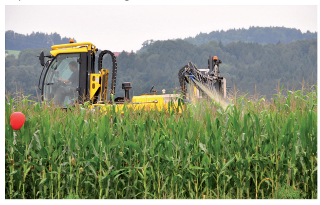
Fig. 1 Specialized sprayer for tall crops during the drift measurements.

The treatment of adults of the corn rootworm on large areas requires high power of impact of plant protection equipment (Fig. 1). In addition to the features of the device such as reliability, tank capacity and maneuverability as well as the driving speed especially the volume rate is very important. Therefore, it should be in the lower range of the specified rate in the approval or authorization of the plant protection product. Since in most cases distance regulations to water bodies or terrestrial structures must be observed, coarse atomizing nozzles must be used, leading to a low degree of coverage on target areas. In addition, the height of the corn crop of up to 3.5 meters requires a good penetration of spray droplets to reach the target areas such as the ears of the corn.