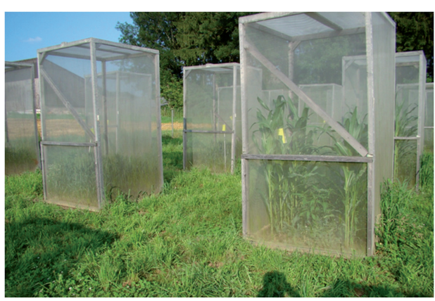
Fig. 1 Isolation cages for recording Diabrotica populations.

Maize is a profitable crop for central European growers. Many farmers prefer maize for feeding cows or pigs and for the maintenance of biogas plants. The western corn rootworm has invaded large parts of the maize growing areas of Central Europe (Edwards and Kiss, 2011). In 2002 the beetle arrived in the eastern parts of Austria and extended in 2012 as well into the southern and western parts. Only a few cases with observed economic damages have been recorded since in invaded areas. Official control measures according to EU Decision 2003/766/EG is in place to prevent the further spread of the western corn rootworm. Crop rotation is known to be the most efficient strategy to suppress the western corn rootworm. The required crop rotation may however lead to economic impacts for growers. In the experiments presented here different plant species to be rotated with maize were studied with respect to their effects on the reproduction of Diabrotica in the field. The population dynamics of Diabrotica was studied in isolation cages in the field (Figure 1).