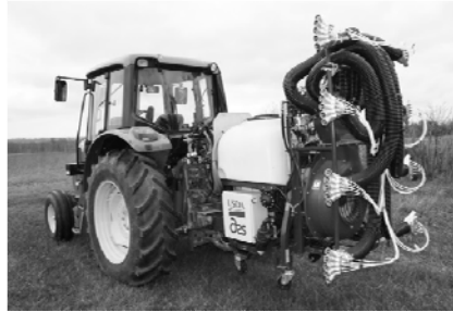
Figure 1. Newly developed automated variable-rate, air-assisted precision sprayer

With the comparable insect control efficiency and better disease controls or prevention, the average application rates during two growing seasons with the laser-guided sprayer were 412 L ha -1 in field #1, 206 L ha -1 in field #2, 309 L ha -1 in field #3, 174 L ha -1 in field #4, and 201 L ha -1 in field #5 while the average application rates from the conventional constant-rate sprayers in these five fields were 767, 514, 973, 377, and 478 L ha -1 , respectively. Moreover, the laser-guided sprayer reduced pesticide use by 46% to 68%. Thus, the new sprayer was able to drastically decrease pesticide usage thus reducing environmental impact and enhancing applicator safety.