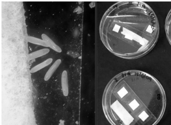
Figure 1 Experimental test exposing C. hemipterus eggs to Vapormate™. On the left: eggs under a cover slide. On the right: Slides with eggs placed in Petri dishes ready for exposure to the fumigant.

Eggs were obtained by allowing 30 adult C. hemipterus to lay eggs over 24 h in the crevice between a microscope cover glass and glass slide formed by gluing them with a paper between both slides (Fig. 1). Eggs were exposed to 420 mg L -1 of Vapormate™ in 2.54-L desiccators for 12 h as described above. Mortality counts were made after 3 d and compared with the control group kept under the same temperature and humidity.