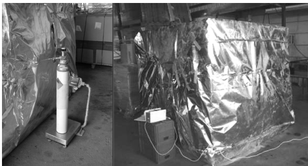
Figure 2 The portable disposable fumigation chamber made of flexible liner laminate on the right connected to a Vapormate™ cylinder on the left.