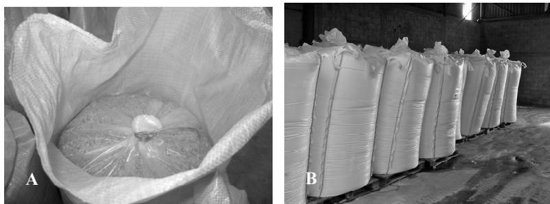
Figure 2 A: 60kg SuperGrainbag with Corn seeds. B: SuperGrainbag -HC™ storing paddy inside woven protective polypropylene bag.

For smaller unit containers of 60 kg to 90 kg capacity, a transportable SuperGrainbag™ (SGB) is used (Fig. 2A). The SGB is a 3-layer coextruded plastic with thickness of 0.078 mm, 3 cc/m 2 /day permeability levels for oxygen and for water vapour of 8 g/m 2 /day. Using the same material, the SuperGrainbags-HC™ has become available for use with mechanized loading, which handles up to a 2-tonne capacity for bags or bulk storage (Fig. 2B).