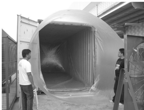
Figure 3 TranSafeliner™ with coffee, Guatemala

To protect bagged or bulk commodities against damage and deterioration when shipping across intercontinental distances in 20- and 40-foot standard shipping containers the TranSafeliner™ was introduced in 2008 (GrainPro, 2008) (Fig. 3).