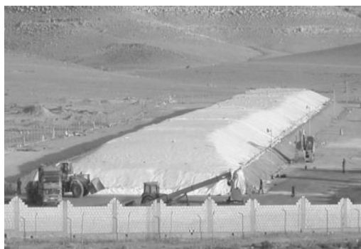
Figure 4 20.000 tonnes of Wheat in Hermetic Bunker, Jordan 2009

Hermetic storage of wheat in “Hermetic Bunkers” with capacities ranging from 10.000 to 20.000 tonnes was first introduced in the early 1990’s, as shown in Figure 4. Hermetic storage of wheat, stored at or below its critical moisture content of 12.5%, provides storage without significant degradation of quality, including maintenance of baking qualities, for up to 2 years (Navarro et al., 1984; 1993). In Cyprus such Bunkers allowed quality preservation of barley for 3 years, with total losses of 0.66% to 0.98%, and with germination remaining above 88% (Varnava and Muskos, 1997).