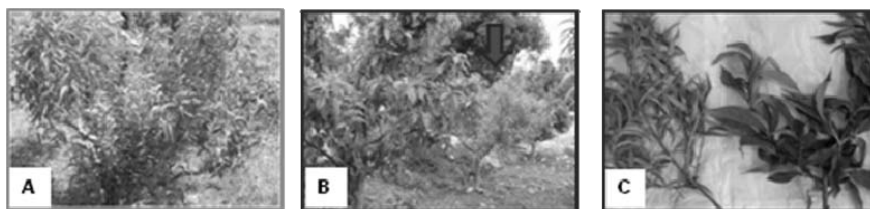
Fig. 1 Characteristic symptoms of AlmWB on peach and nectarine. A. Shoot proliferation on nectarine, B. Comparison of infected (red arrow) vs. healthy peach tree, C. Close up view: infected nectarine branch (left) vs. healthy one (right)

In 2008, About 110 nectarine and peach trees in two orchards in the Sarada plain (South Lebanon) showed characteristic symptoms of shoot proliferation; smaller leaves with a light green color (Fig. 1). Nested PCR and sequencing confirmed infection by AlmWB. Farmers eradicated all symptomatic trees.