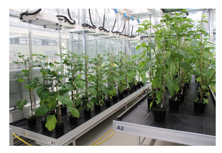
Fig. 1 Plants of the S. nigrum complex in greenhouse.

For estimation of the DNA content of plants and callus material was cut with a sharp razor blade in Galbraith buffer (GALBRAITH, 1983). The filtered suspension of nuclei was stained with propidium iodide. Measurement was done using BD FACSCalibur<sup>™</sup>. AFLP analysis was described in MATASYOH et al. (2015).