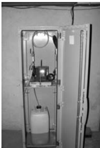
Fig. 1 Small system for spraying the grain