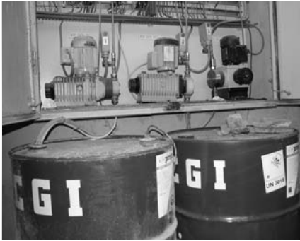
Fig. 3 Insecticide application system