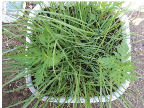
Figure 1. Competition between common ragweed and Lolium perenne in additive pot experiments. The density of common ragweed is constant, while the density of the other plant species is varied.

Assessment: fresh and dry shoot weight of Ambrosia and other competitor plants/pot