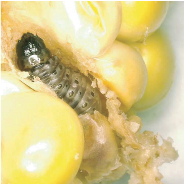
Fig. 1. ECB ( Ostrinia nubilalis (Hübner) larva in corncob from Boeslunde, Denmark 2010.