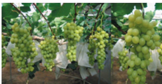
Fig. 1: Cluster of 'Ruiduxiangyu' grape.