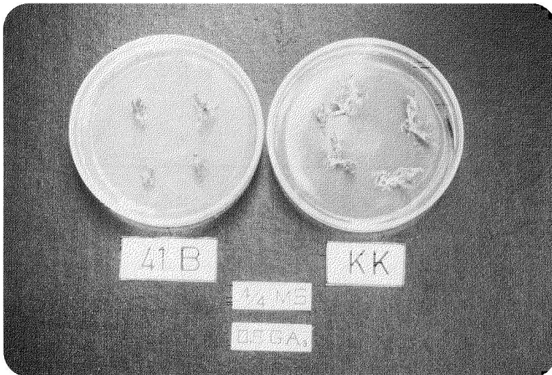
Fig. 1: Development of apical meristems in the establishment medium of MS supplemented with 0.5 mg/l GA_3 .

Results on rooting and entire plant formation in rooting medium were found to be rather different according to the genotypes. Highest root formation was obtained in the combinations of 1.0 mg/l IBA x 0.0 mg/l BAP (86.7%) and 1.0 mg/l IBA x 0.5 mg/l BAP (85.7%) for Kalecik Karasi; 5.0 mg/l IBA x 0.0 mg/l BAP (100.0%), followed by 2.5 mg/l IBA x 0.0 mg/l BAP (90.0%) and 5.0 mg/l IBA x 0.5 mg/l BAP (90.0%) for 41 B. In entire plant formation, similar combinations as above gave the best results: 1.0 mg/l IBA x 0.5 mg/l BAP (71.4%) and 1.0 mg/l IBA x 0.0 mg/l BAP (66.7%) for Kalecik Karasi; 5.0 mg/l IBA x 0.0 mg/l BAP (80.0%) and 5.0 mg/l IBA x 0.5 mg/l BAP (70.0%) for 41 B (Table 3, Fig. 3).