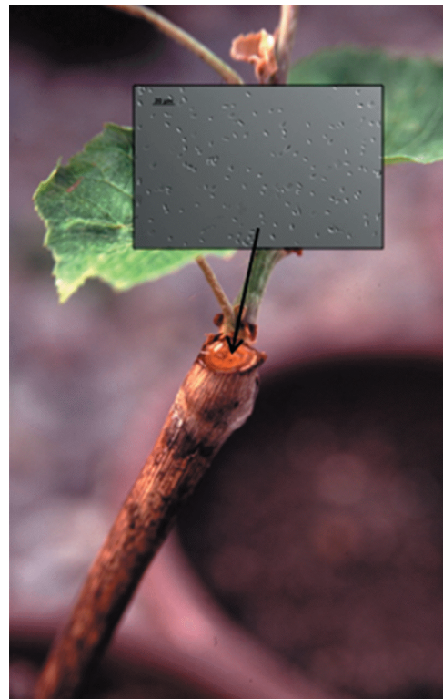
Fig. 1: Artificial infection of pruning wound with conidial suspension of Phaeoconiella chlamydospora .

Artificial infection: Appr. 7 d after outgrowth pruning was simulated by removing the uppermost portion of the shoot; the upper node was not affected. The resulting pruning wounds were inoculated with 40 µL of the above conidial suspension (Fig. 1). Control plants were treated with sterile water. For each cultivar, 40 plants were assigned for infection, 20 plants remained non-infected.