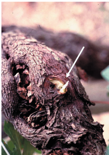
Fig. 1: Example of spring wound on the trunk of a 'Cabernet Sauvignon' vine after sucker removal.

two weeks (Experiments 2a and 3a) or after one year (Experiments 2b and 3b). Between 20 and 30 spring wounds were assessed per treatment.