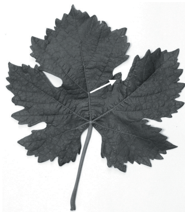
Fig. 2: A typical leaf blade of the 'Žametovka' variety with a tooth in the lateral sinus (indicated by arrow).

peratures. Our observations of numerous phenotypic traits showed that the 'Žametovka' group is not very uniform. Typical ripe infructescences of the original (not improved) genotypes, such as 'Žametovka' - Vinjar 2 from the Dolenska wine growing district, SE Slovenia) contain numerous hard green berries. With systematic selection, breeders gradually changed this undesirable characteristic and developed improved genotypes – e.g. 'SI-25', the clone, which is characterised by much more homogenous berry colour. Another trait that has to be improved is the infructescence size. The selection should take into consideration genotypes (mutants) with smaller fruit clusters. Owing to a lower yield load, canes will be able to reach full maturity and therefore become more tolerant of winter frost.