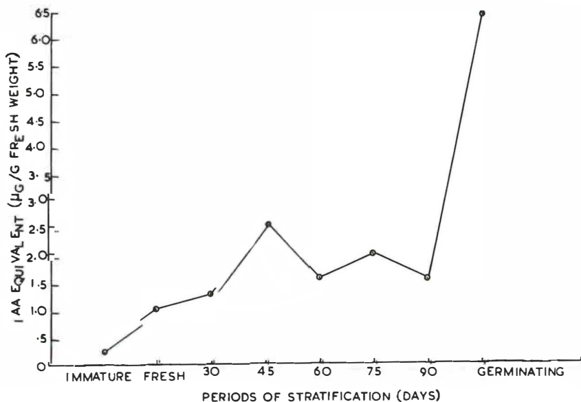
Fig. 1: Auxin content in Anab-e-Shahi grape seeds after stratification.

The quantity of auxins from all the Rf positions was pooled together and presented in Fig. 1 as IAA equivalent ( \mu\text{g/g} fresh weight of seeds). The amount of