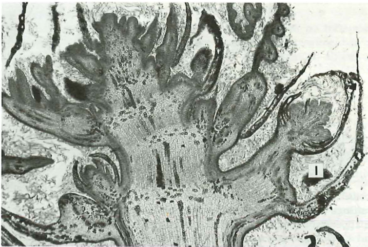
Fig. 3: Longitudinal section of a shoot tip carrying inflorescence (I) sprayed with CCC at 20 °C.

In the third experiment, inflorescence initiation was also induced by CCC, though to a lesser extent, on the growing primary shoots of cuttings in the growth